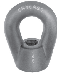
Drilled & Tapped