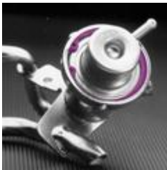
HO ring retains the valve of this fuel rail assembly.