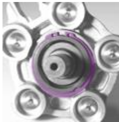
VSH ring used on an automotive air conditioning compressor.