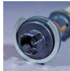
KL spiral ring on a transmission cooling valve.