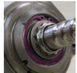
Beveled VHO ring in an automotive power steering assembly.